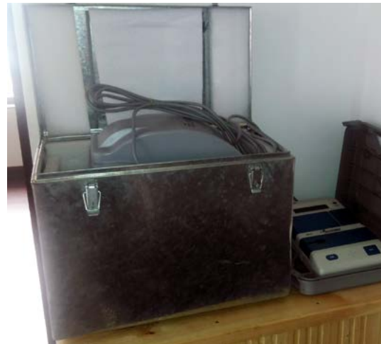
VVPAT kept inside a trunk