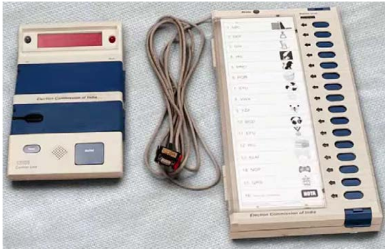
Electronic Voting Machine

Ballot Unit and Control Unit are first kept in plastic cases and then these plastic cases are kept in trunks.