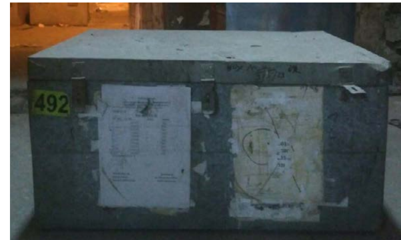
Trunks used for storage