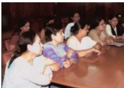
The above photo shows a few women Members of Parliament.

Why do you think there are so few women in Parliament? Discuss.